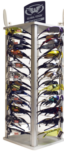
40-PC ROTATING METAL WIRE COUNTER DISPLAY D-40M $105.90 OR FREE WITH A $353.00 ORDER DISPLAY SIGNS ON PAGE 5