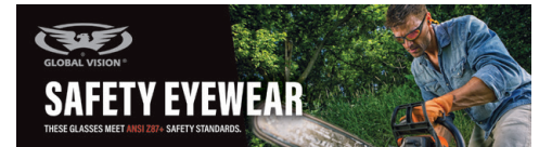
D-SIGN SAFETY 1