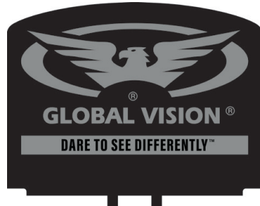
D-40 GV SIGN