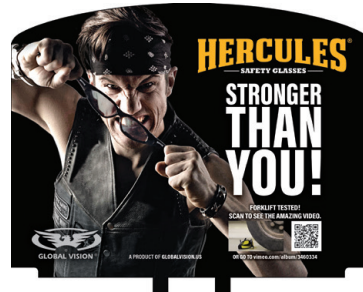
D-40 HERCULES® SIGN