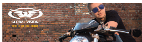
D-SIGN SPORT 2