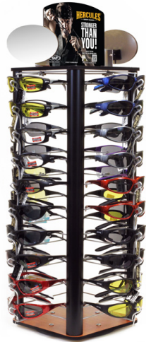
40-PC ROTATING DARK WOOD COUNTER DISPLAY D-40M WOOD $105.90 OR FREE WITH A $353.00 ORDER 32" H (35.5" H WITH SIGN INCLUDED) X 18" D X 18" W DISPLAY SIGNS ON PAGE 5