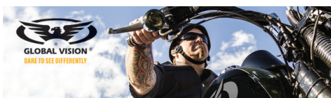
D-SIGN HARLEY 2