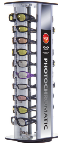
20-PC ROTATING LOCKING COUNTER DISPLAY D-20PC LOCKING $147.75 OR FREE WITH A $495.00 ORDER 33.25" H X 9.25" D X 14.25" W