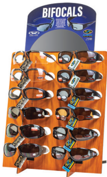
12-PC BIFOCAL COUNTER DISPLAY D-12PC DX BIFOCAL 12-PC DARK WOOD $24.50 OR FREE WITH A $150.00 ORDER 23" H X 10" D X 14" W