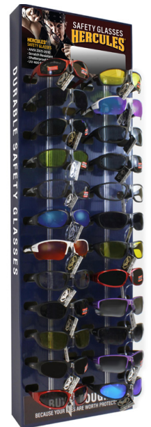
24-PC HERCULES SIDE WING DISPLAY D-24PC SW HERCULES $35.00 OR FREE WITH A $120.00 ORDER 13" H X 2.75" D X 40.25" W