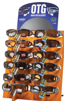
12-PC OVER THE GLASSES COUNTER DISPLAY D-12PC DX OTG 12-PC DARK WOOD $24.50 OR FREE WITH A $150.00 ORDER 23" H X 10" D X 14" W