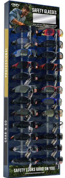
24-PC SAFETY SIDE WING DISPLAY D-24 SW SAFETY $35.00 OR FREE WITH A $120.00 ORDER 13" H X 2.75" D X 40.25" W