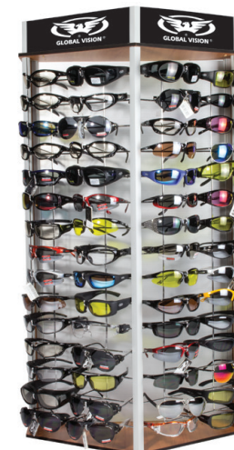
60-PC MULTI-FUNCTION DISPLAY D-60PC SX $150.00 OR FREE WITH A $500 ORDER 41.6" H (45.6" H WITH SIGN INCLUDED) X 11.25" D X 24" W DISPLAY SIGNS ON PAGE 5