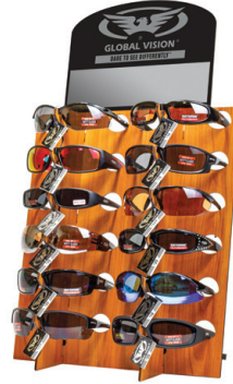
12-PC GLOBAL VISION COUNTER DISPLAY D-12PC DX GV 12-PC DARK WOOD $24.50 OR FREE WITH A $150.00 ORDER 23" H X 10" D X 14" W