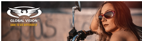
D-SIGN HARLEY 1