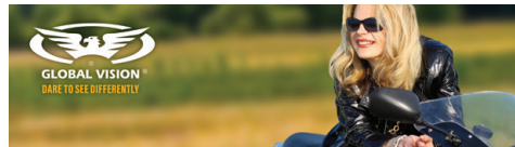
D-SIGN SPORT 1