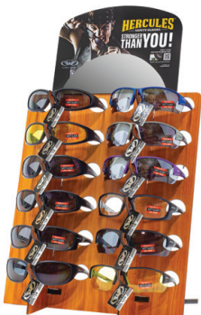
12-PC HERCULES® COUNTER DISPLAY D-12PC DX HERCULES® 12-PC DARK WOOD $24.50 OR FREE WITH A $150.00 ORDER 23" H X 10" D X 14" W