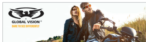
D-SIGN SPORT 3